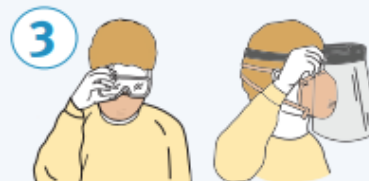
3 Protective eyewear /faceshield