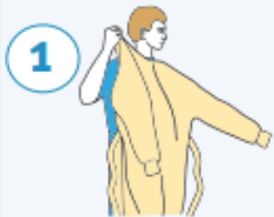
1 Long-sleeved, preferably fluid-resistant gown