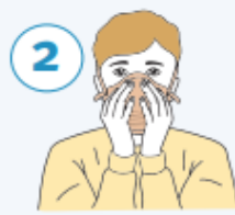
2 P2/N95 respirator